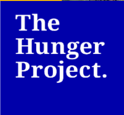
Burkina Faso, 2023

Hunger is about more than food. It's about people.